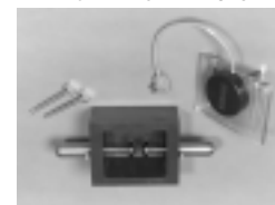
TCCE90 ASTM D1816 and ASTM D877