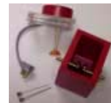
TCVDE ASTM D1816