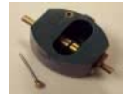
TCDE ASTM D877